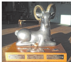
William J. Dubuc Trophy — Awarded for Offshore 160's Best Elapsed Time Finish