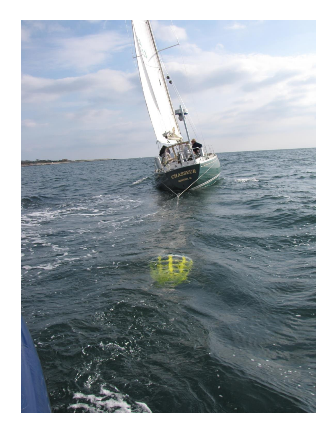
A Guide to Steering without a Rudder Methods and Equipment Tested Michael Keyworth

This guide is the result of multiple tests conducted in the fall of 2013 off of Newport, RI. The test vessel was a modified MK I Swan 44, Chasseur . The purpose of the tests was to determine